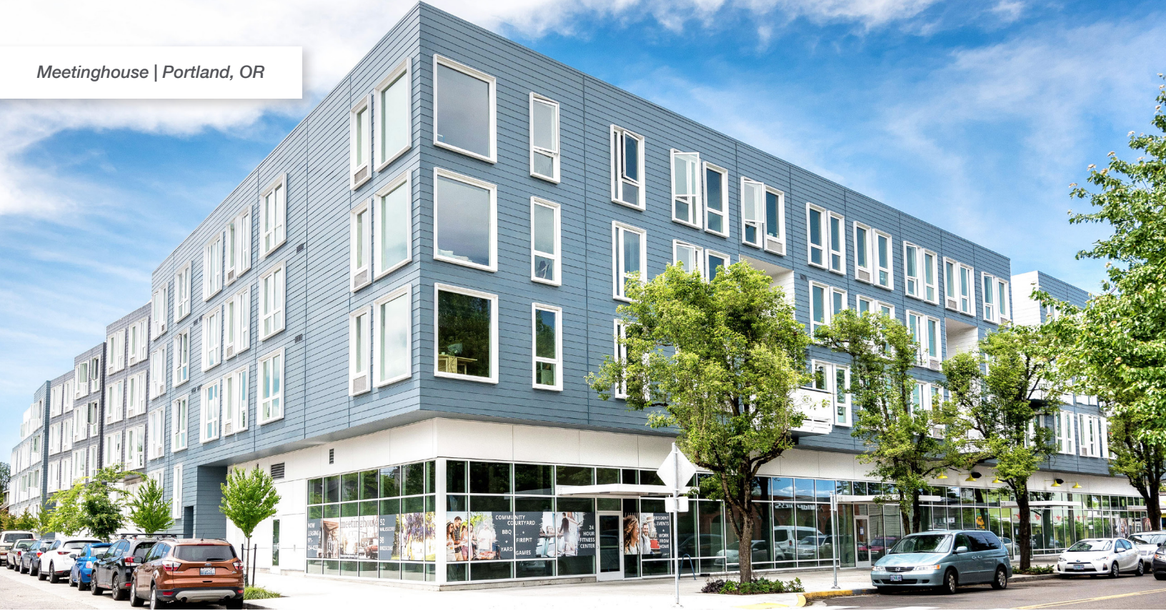
Meetinghouse | Portland, OR