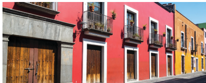
Architectural LATAM and AP