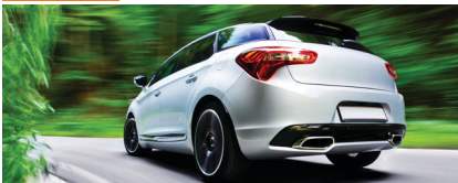
Automotive OEM Coatings