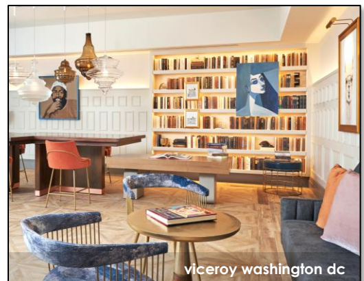
viceroy washington dc