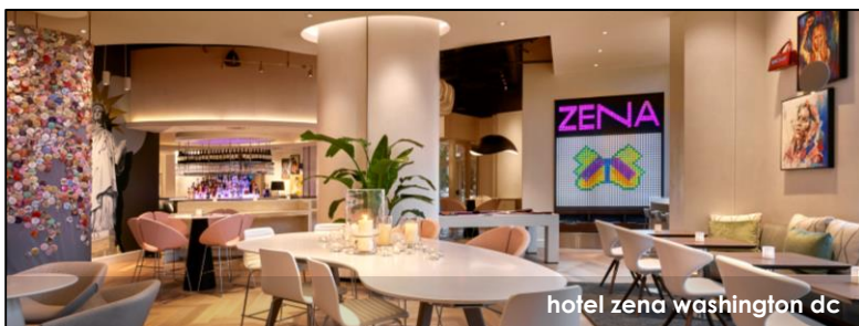
hotel zena washington dc