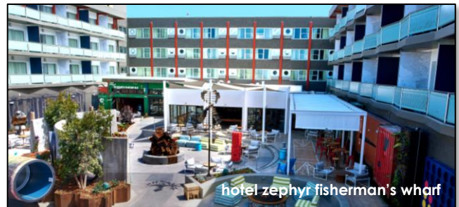
hotel zephyr fisherman's wharf