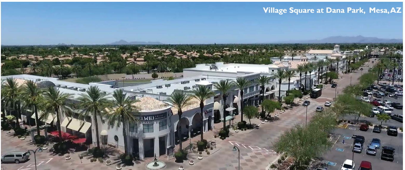
Village Square at Dana Park, Mesa, AZ

Although our returns have been impressive, we continue to believe that our current market valuation does not reflect the true value of our enterprise. We believe that our entrepreneurial culture and the well-synchronized execution of our unique business model will result in a market valuation, over time, more in line with the true value of the enterprise, providing a tremendous opportunity for our shareholders.