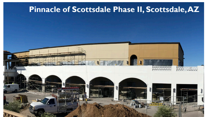
Pinnacle of Scottsdale Phase II, Scottsdale, AZ