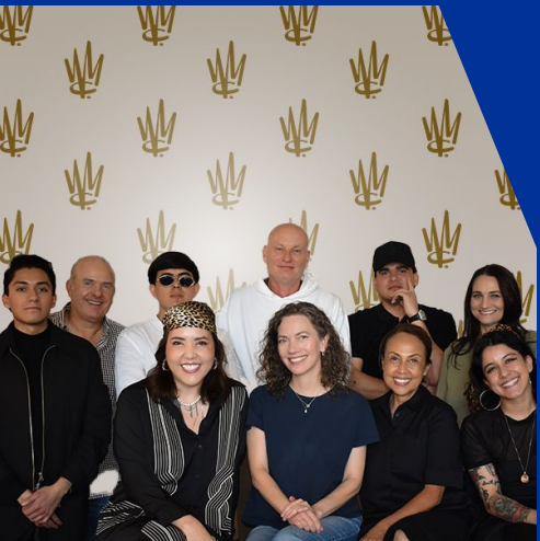
RICO O MUERTO Inked a global publishing deal with fast-rising Mexican independent record label