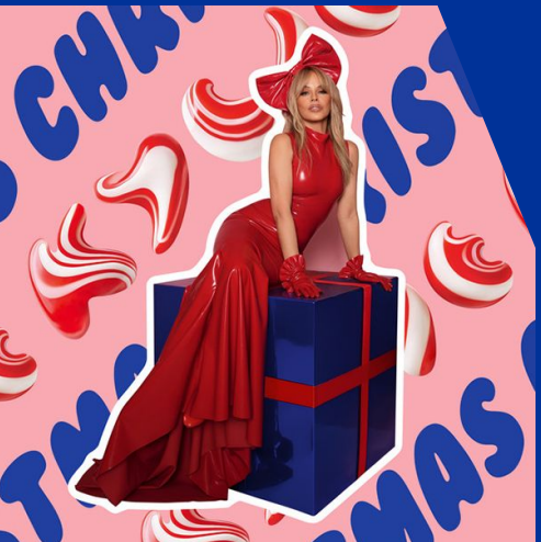
KYLIE MINOGUE Earned 11th UK No. 1 album with 'Kylie Christmas (Fully Wrapped)'