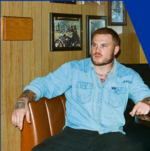
ZACH BRYAN Debuted at No. 1 on the Billboard 200 with 'With Heaven on Top'