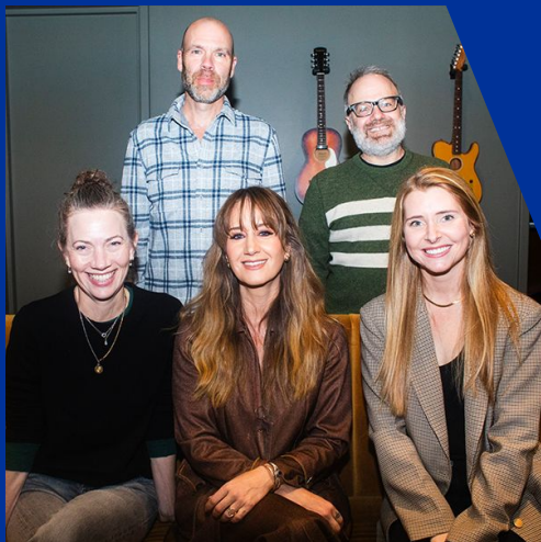
MARGO PRICE Signed global publishing agreement with Grammy-nominated singer-songwriter