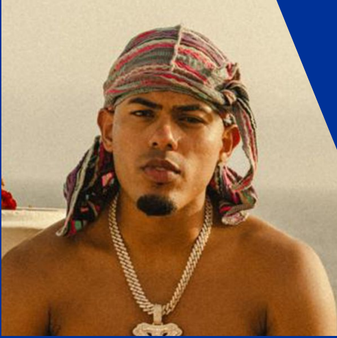
MYKE TOWERS Scored 16th Billboard Latin Airplay No. 1 with "TENGO CELOS"