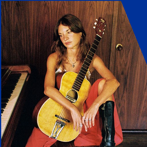
AMY ALLEN Won Songwriter of the Year at the Grammys for the second consecutive year