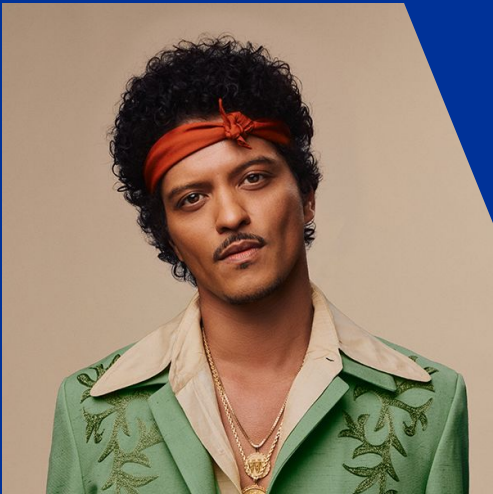
BRUNO MARS Hit No. 1 on the Billboard Hot 100 with "I Just Might" from his upcoming album